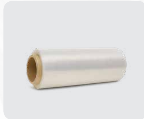
Manual Stretch Film