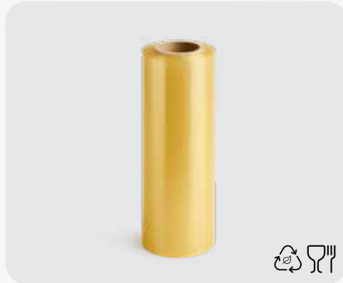
Biodegradable PVC Film