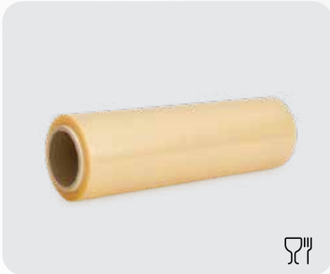
PVC Film 30cm 12 microns 600m