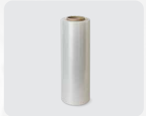
Automatic Stretch Film