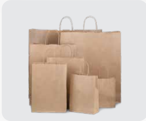
Kraft Paper Bags