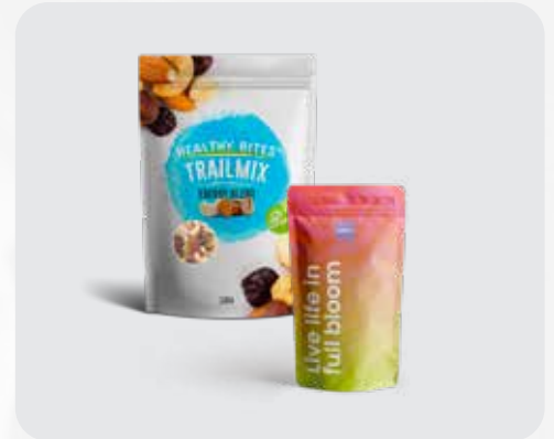
Custom Printed Stand Up Pouches