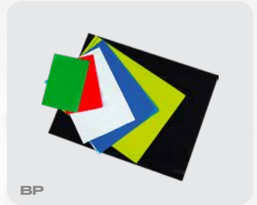
Colored Poly Bags