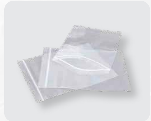
Zip Locking Bags