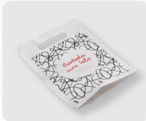
Custom Printed Retail Shopping Bags