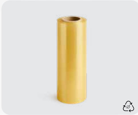
Biodegradable PVC Film