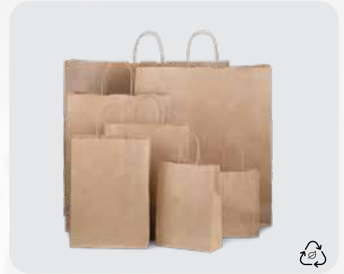
Kraft Paper Bags