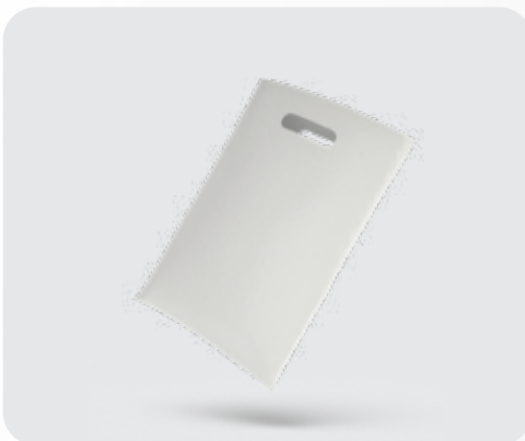
Retail Shopping Bags