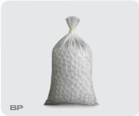
Plastic Ice Bags