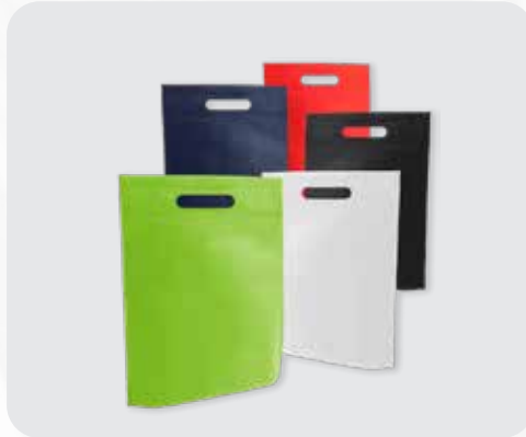
Ecological Non-Woven Bags