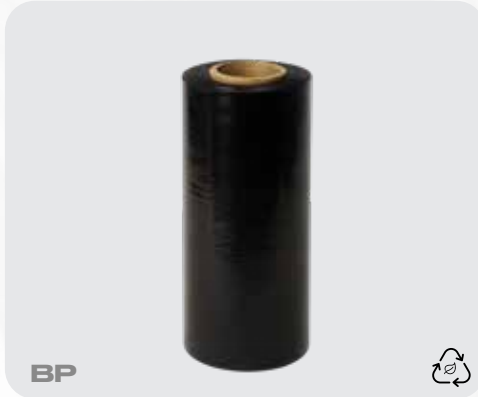
Black Polyethylene Plastic Cal.600