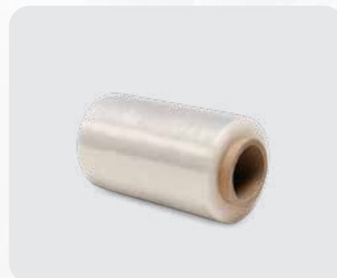
Mini Stretch Film Roll without handle