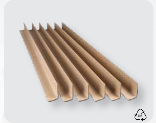
Corrugated Corner Pieces