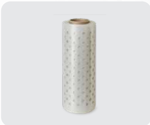
Macroperforated Stretch Film