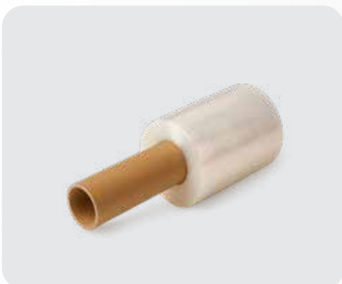
Mini Stretch Film Roll with cardboard handle