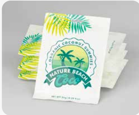
Custom Printed Pouches