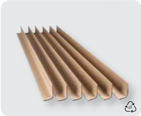
Corrugated Corner Pieces