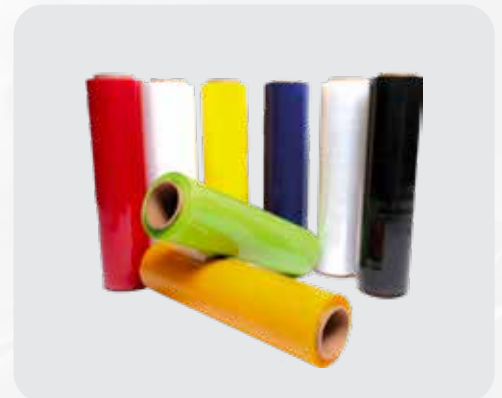
Colored Manual Stretch Film